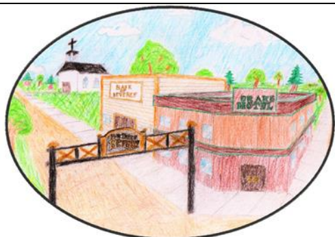
Picassos of Beverly 2022

Call Crystal at 780-289-0995 to get yours today or pick one up during The Gud Box pick up times at the rink - 4:30-6:30pm Nov. 12, 26, Dec. 10, 31, 2021.