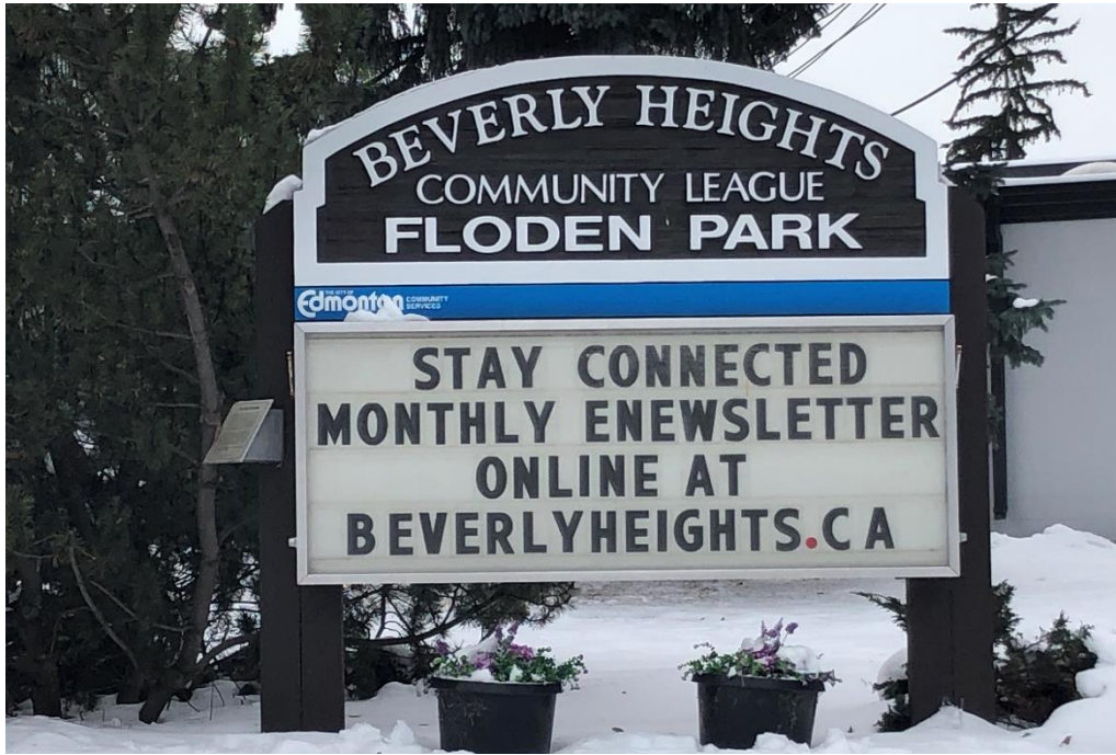
THE SIGN IN FRONT OF THE COMMUNITY HALL AND FLODEN PARK (4209 111 AVE)