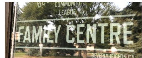
Community League - Page 3