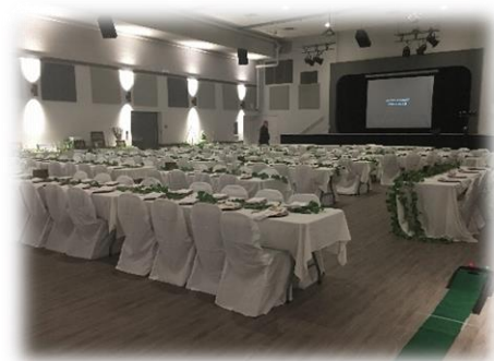
Main Hall set up for a wedding.

For photos and more information about rentals visit the Rentals tab at beverlyheights.ca or email rentals.bhcl@gmail.com .