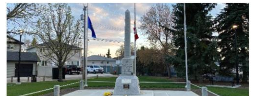
Rich History - Page 2