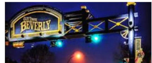
What is in the area? - Page 4