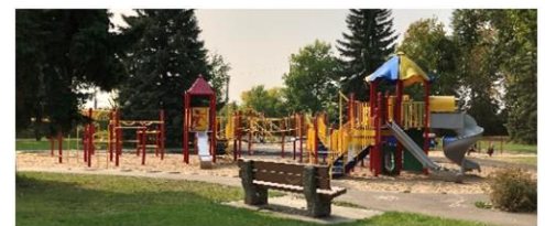
Outdoor Spaces - Page 2