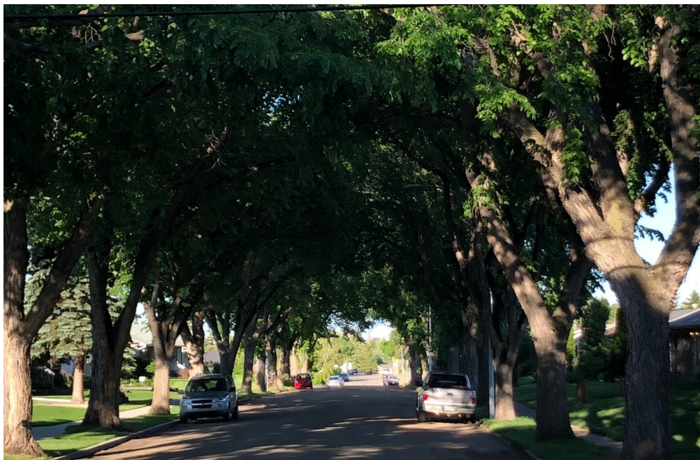
Beautiful elm boughs shading the Beverly Heights streets